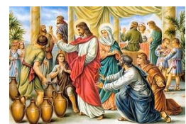
Sunday Gospel 'The

Please discuss this right with your child and what it means.