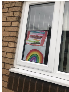
During the coming weeks, there will be different themes, as follows: